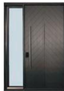
Luxury Custom Entry Door