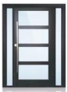
Modern Entry Door

The Entry Door Series is designed to complement the entrance of American homes, offering both security and style. Tailored to meet the specific needs of homeowners, this series features customizable options that allow you to create a unique entryway, with the added convenience of made-to-order designs based on your own specifications. Whether you're seeking a classic or contemporary look, the Entry Door Series provides the perfect blend of aesthetics, durability, and personalization, ensuring your home's entrance makes a lasting impression.