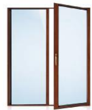
Ultra-Narrow Frame Wood Alu-Clad Window (103s)