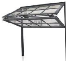
Smart V-Top-Fold Window (coming soon)