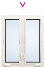
Classic Alu Crank Opening Window (86s)

The Classic Series features the timeless American classic crank opening window, combining traditional charm with modern functionality. Designed to offer effortless operation and enduring style, this series brings the best of classic craftsmanship to contemporary living. With its elegant design and reliable performance, the Classic Series is perfect for those who appreciate the timeless appeal of a crank window while enjoying the benefits of today's advanced materials and energy-efficient features. Ideal for both new builds and renovations, it adds a touch of nostalgia and sophistication to any home.