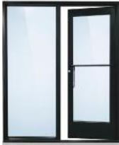
Storefront Window Wall Door (110s)