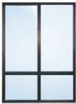
Storefront Window Wall (110s)