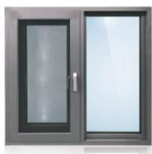
Impact Resistance Alu Outward-Opening Window (128s)

The Islands & Florida Series is specifically designed for high-velocity hurricane zones in the coastal Southeast and islands. Offering custom windows and doors built to withstand extreme weather conditions, this series combines robust protection with stylish design. Engineered for durability and safety, the Islands & Florida Series provides peace of mind without sacrificing aesthetic appeal, ensuring your home remains secure and beautiful even in the face of harsh storms. Perfect for coastal environments, it delivers both resilience and elegance for homeowners in hurricane-prone regions.