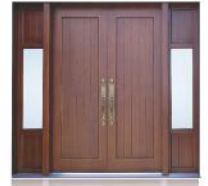
Classic Wood Entry Door