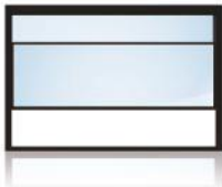
Smart E-Lift Window (coming soon)