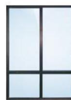
Impact Resistance Alu Window Wall (110s)