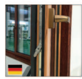
The Multi-Point Locks Have Fewer Parts

The Electroplating Handle Can Be Used Repeatedly.