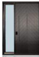
Luxury Custom Entry Door