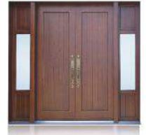
Classic Wood Entry Door