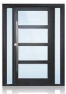
Modern Entry Door

The Entry Door Series is designed to complement the entrance of American homes, offering both security and style. Tailored to meet the specific needs of homeowners, this series features customizable options that allow you to create a unique entryway. With the added convenience of made-to-order designs based on your specifications. Whether you're seeking a classic or contemporary look, the entry Door Series provides the perfect blend of aesthetics, durability, and personalization, ensuring your home's entrance makes a lasting impression.