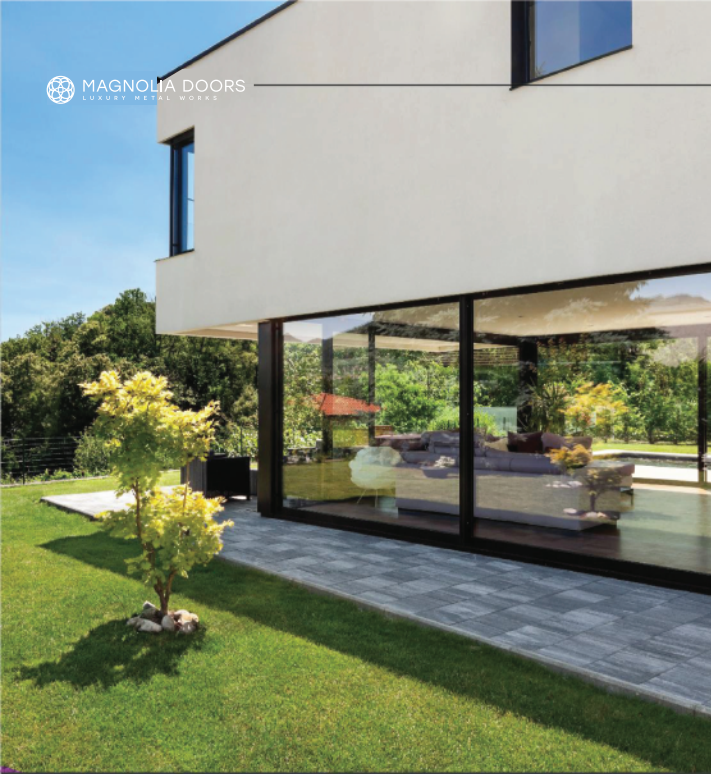
Alu+ 160s Heavy Duty Lift And Slide Door